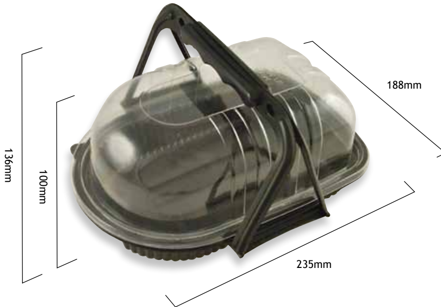
Chix Roaster Carry Dome