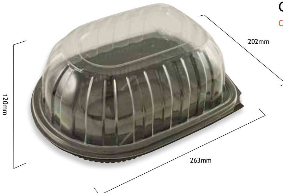
Chix Roaster Dome